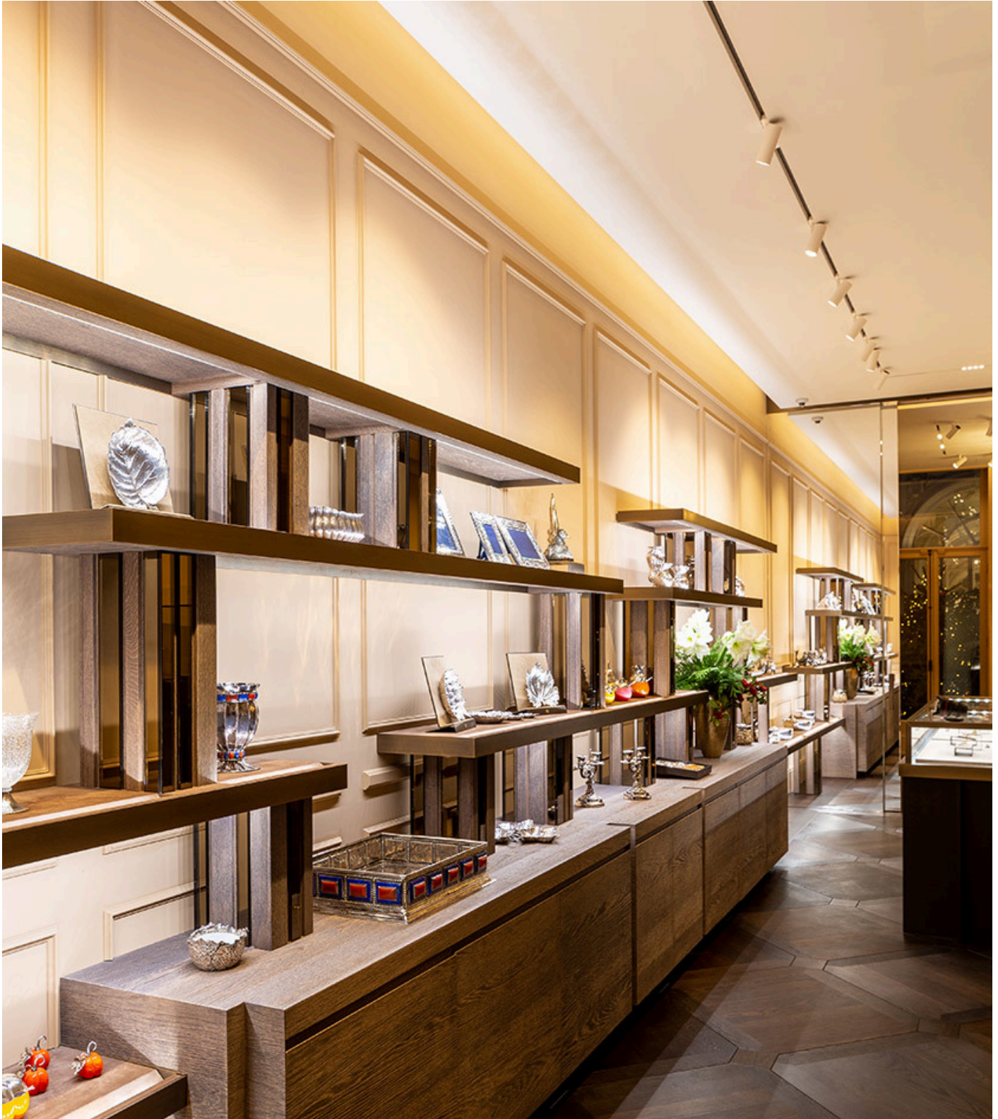
A.24 System + Vector Magnetic - Carlotta de Bevilacqua

Artemide lit up the London boutique with A.24 System , an open platform that can manage multiple lighting tools to achieve seamless integration into the space, and furthermore allowing the designer to apply the correct typology and dose of light where appropriate.