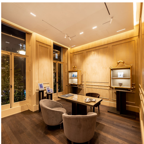
A.24 Magnetic + Vector Spot - Carlotta de Bevilacqua