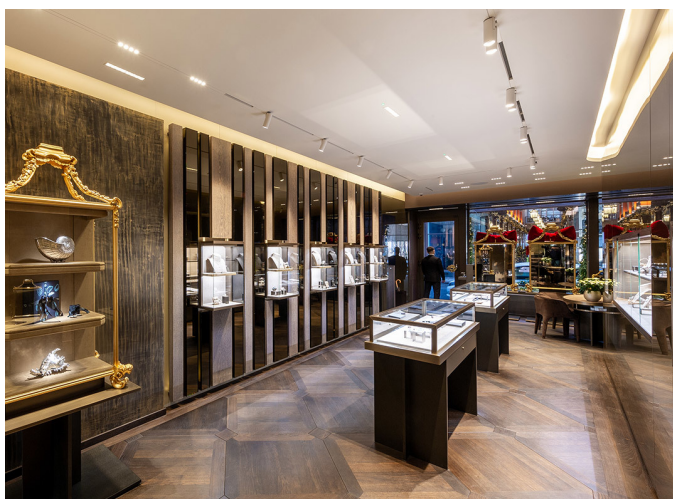
A.24 System + Vector Magnetic - Carlotta de Bevilacqua