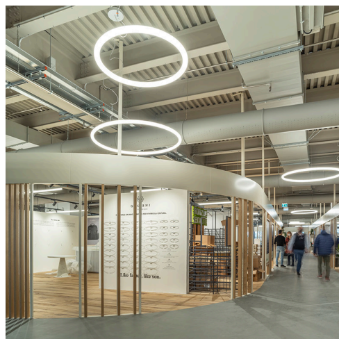
AoL Circular - BIG