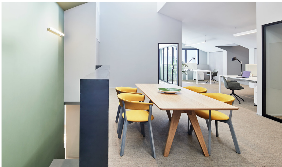
AoL Linear Wall - BIG | Tolomeo - Michele De Lucchi & Giancarlo Fassina | A.39 - Carlotta de Bevilacqua